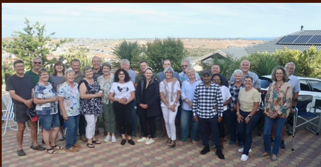
Bostaande fotos is van Lemoendui Slot se Inwoners wat Saterdag 17 Januarie 2026 'n gesellige straatbraai gehou het.